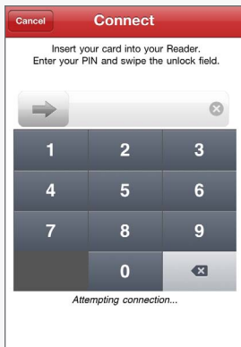
Protected messages require CAC PIN access.